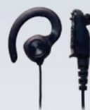
● Wired Earpiece