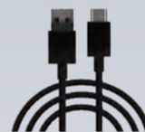
● Data Cable